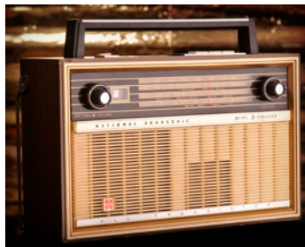
A Classic Old Radio.

We thought we’d show you some of the things we’ve been photographing lately; people often ask us, so here are a few!