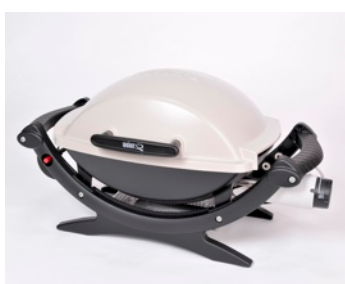
A Weber Q Barbeque.