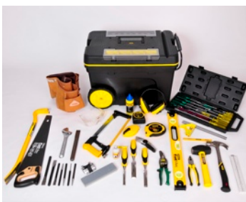
A new Stanley tool kit.