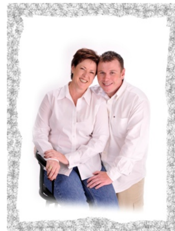
A lovely couple.