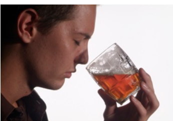
Testing a new brew!